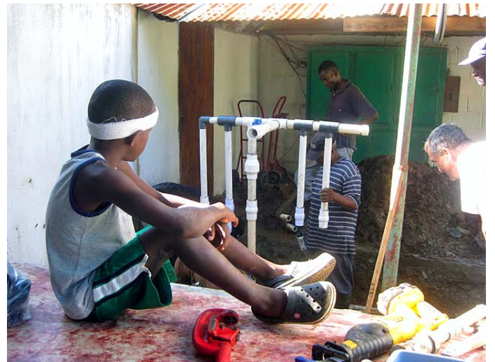
For the help that we received from HBS friends in Canada to upgrade our water system to continue to provide potable water and better serve the Limbé people.

HBS Foundation Inc. PO Box 1290 Lake Worth, FL 33460