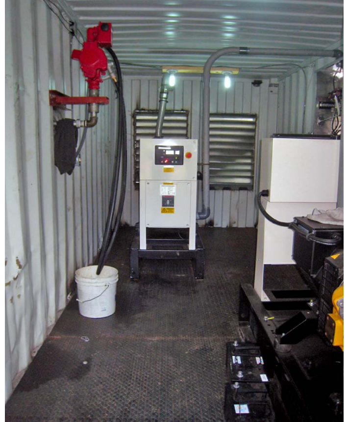
For the new HBS Motor House and Generators, donated and installed by HBS friends in Iowa and Canada, very much needed to be able to carry on our work in Haiti.