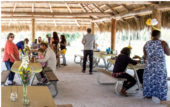
Celebration of Life - 11/19/2016 - Jupiter Florida