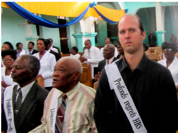
Memorial Service - 11/19/2016 Limbé, Haiti